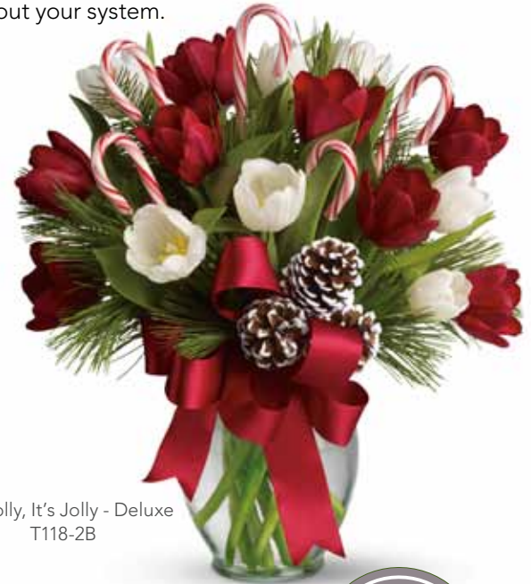
By Golly, It's Jolly - Deluxe T118-2B

To view any tutorial, be sure the latest version of Flash Player is installed on your computer. To access your free Flash download, or to update, visit www.adobe.com and search Downloads.