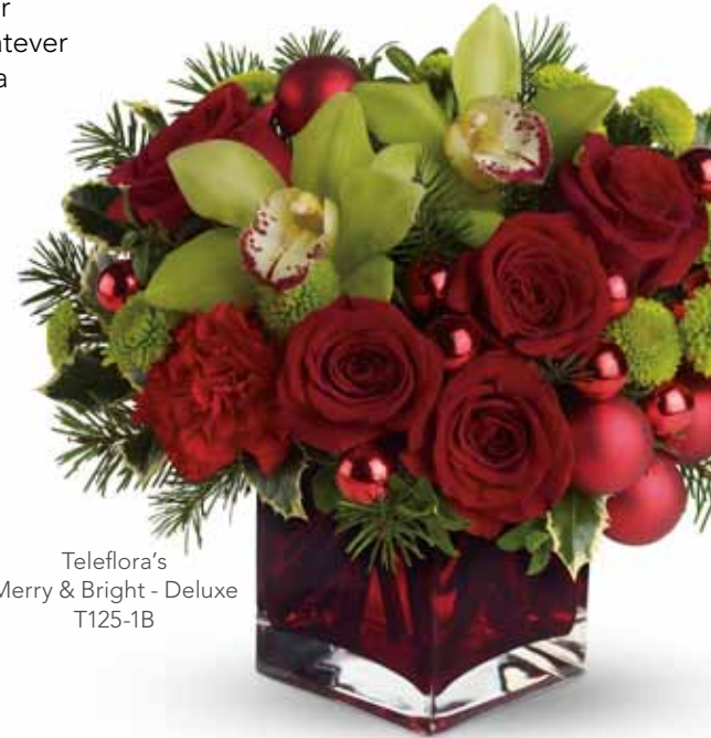
Teleflora's Merry & Bright - Deluxe T125-1B

You can also contact our eFlorist Support team to have them set up a promotion code and have it appear in upcoming marketing emails. Call us at 866.983.3932 or email us at eFlorist@teleflora.com.